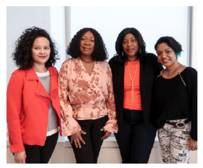
Community Impact Team (Photo taken pre-COVID-19)

The pandemic intensified the financial situation of many entrepreneurs and we saw the impact on our members that didn't have healthy savings or cashflow reserved for their businesses. We recognize that savings is an important tool for micro-members and entrepreneurs. Looking forward, our goal is to strengthen their ability to save through the development of new tools and programs.